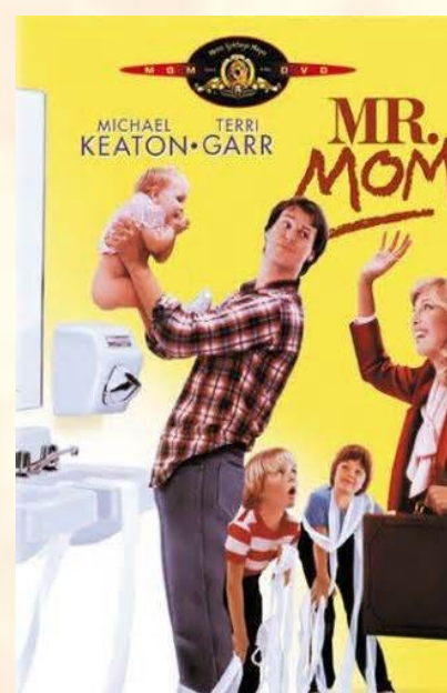
MR MOM (1983)