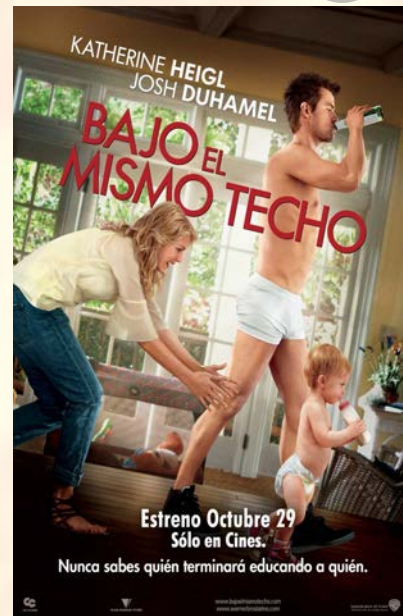
LIFE AS WE KNOW IT (2010)